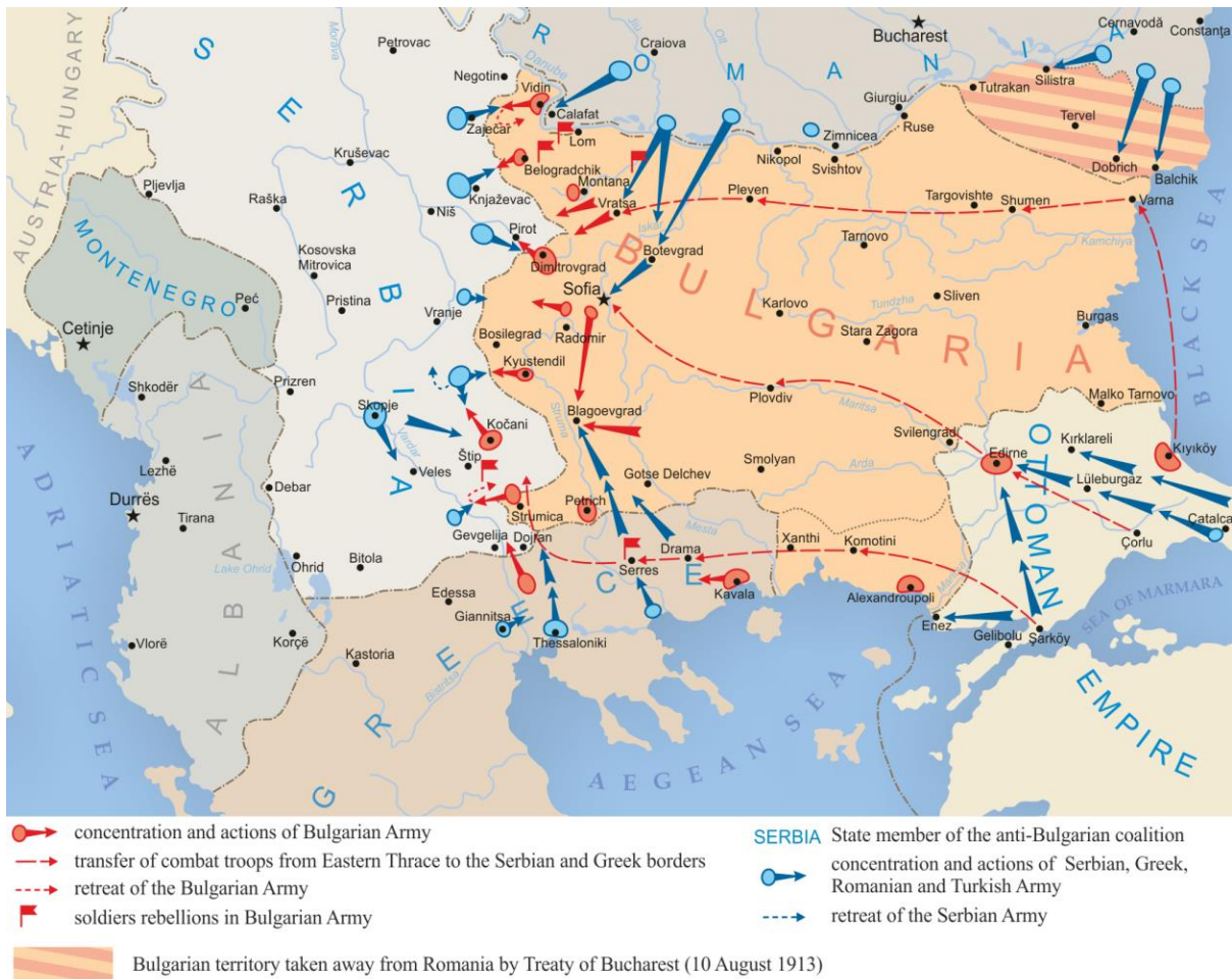
Picture 4. This picture describes the conflict between Bulgaria and anti-Bulgarian coalition during the second Balkan war. Coalition was trying to surround the Bulgarian army and force them to give up.