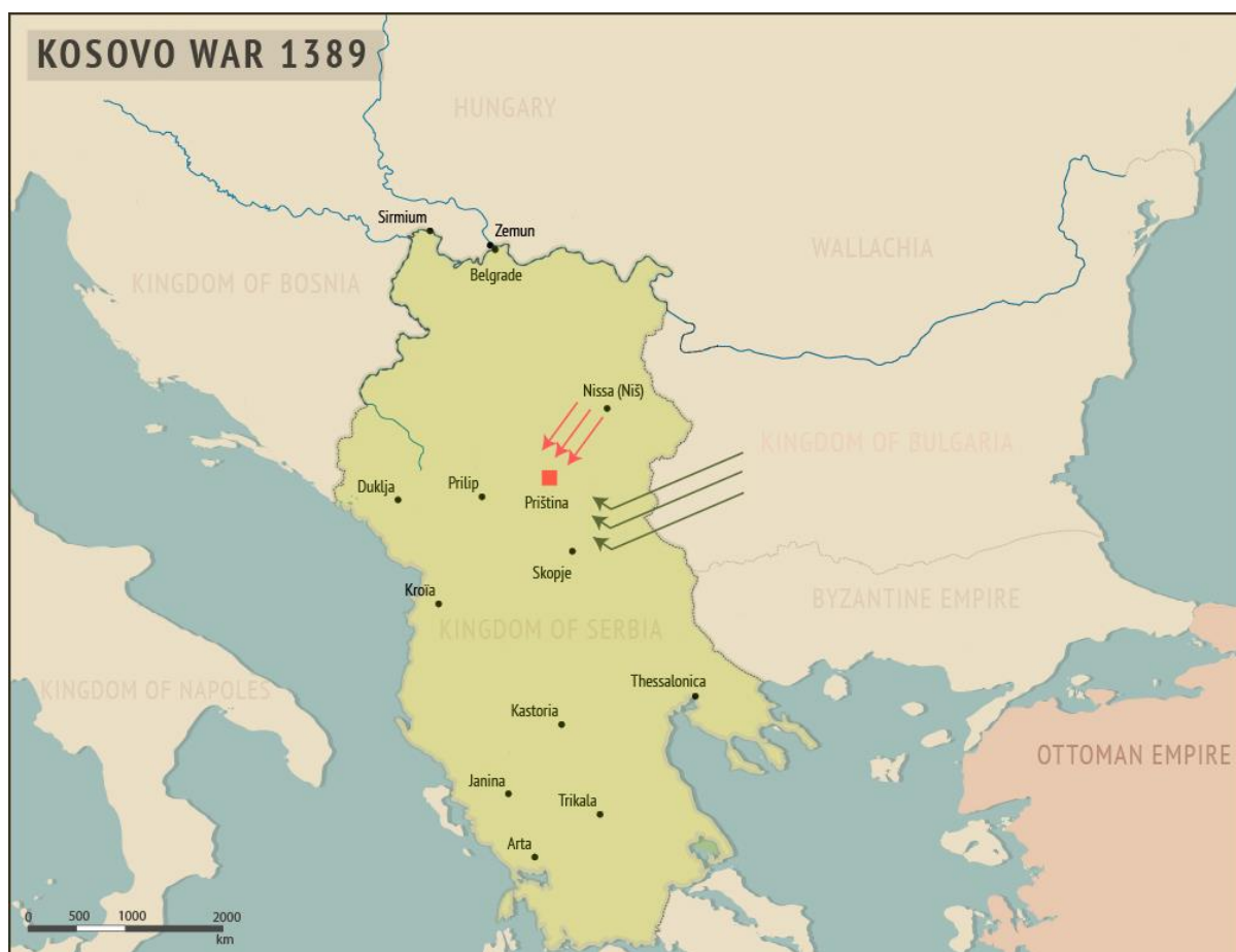
Picture 2. On this Picture we can see, how the fight between Serbians and Ottomans looked like. The battle took place 5 miles from Pristina. Red arrows are showing us the Serbian army and Black arrows the Ottoman army. Lazar's army was defeated and Serbians ended up with Turkish supremacy for almost 500 years.