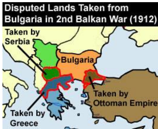
Picture 5. Here we can see which territories did Bulgaria lose after second Balkan war. Ottoman empire got East Thrace (portrayed with brown), Greece took south Macedonia plus West Thrace (portrayed with blue) and Serbia took middle Macedonia, Sandžak and Kosovo (portrayed with green colour).